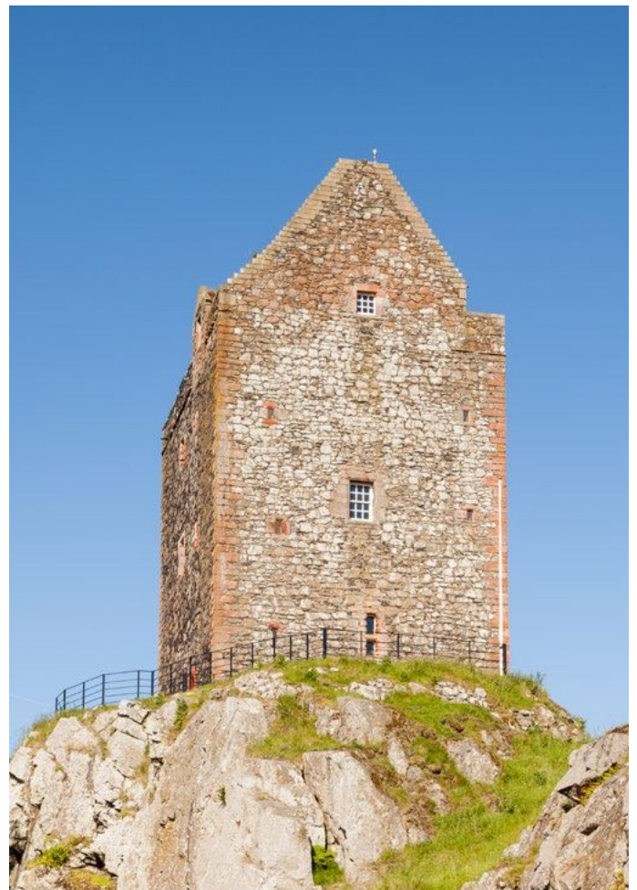
Smailholm tower in the Scottish Borders. The tower was built in the 1400's as protection from border raiders and the elements.